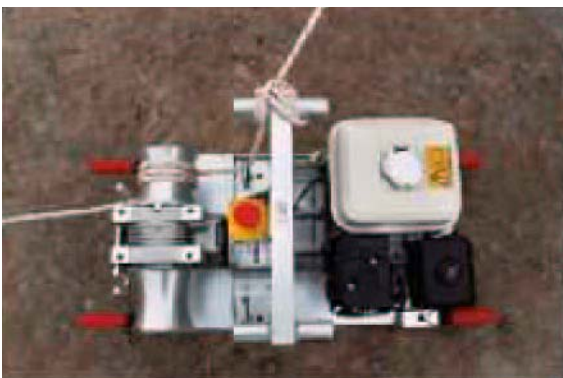
View Showing Line Tied Off