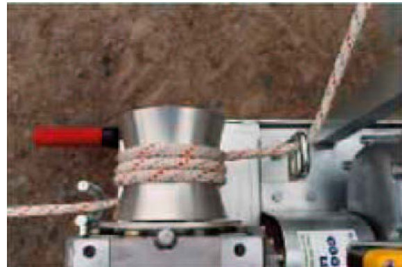
Top Detail View